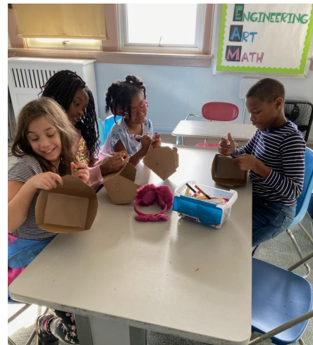
Nita M Lowey

After-School at Provident is funded by the Nita M. Lowey 21st Century Community Learning Center grant. This grant allows students at PCS to attend After-School for free! After-School is Monday through Thursday from 3:30 pm until 6:30 pm. During After-School, students will participate in two 30-minutes programs each day along with 45 minutes of Math Intervention and another 45 minutes of Reading Intervention. Dinner is also provided to students at 6 pm daily. All After-School information can be found on the PCS website .