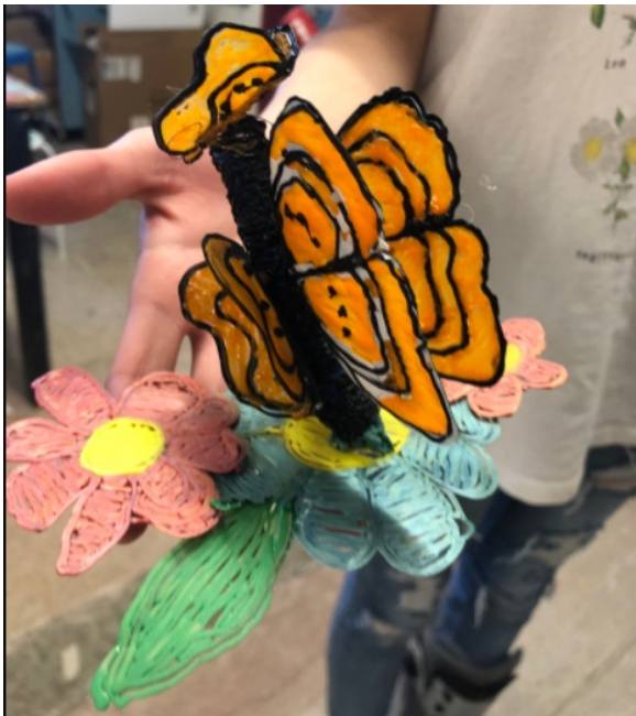
6th Graders Organic Form 3D Pen Sculpture with foil armature

Participation are the criteria used in assessing student success for this Unit.