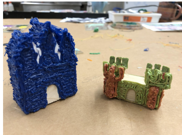
4th Grade Student Projects 3D Pen Castle Build with wood armature